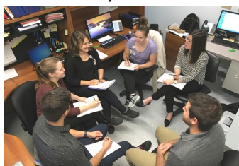
GMH team during their RI Huddle Examples of these strategies include:

identified 90 min/day as an incremental step towards achieving the provincial target of 180 min/day. When a patient's RI is not meeting this incremental goal, the team identifies ways to increase intensity.